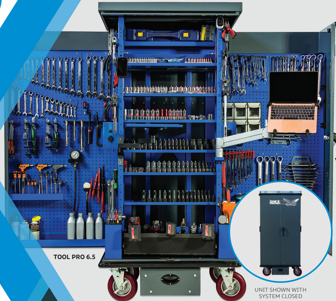
TOOL PRO 6.5